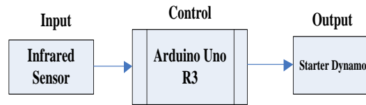
Figure 1. System Design Diagram